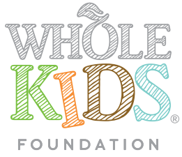
PRIMARY STACKED Used most frequently.