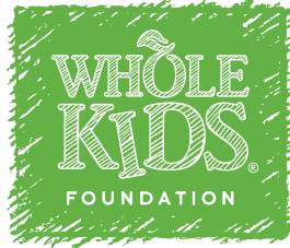
2-COLOR SKETCHBOX Used only if you have to place the logo on a busy background. We do have a reversed logo that can be used instead of the sketchbox.