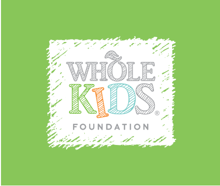
SKETCHBOX Used only if you have to place the logo on a busy background. We do have a reversed logo that can be used instead of the sketchbox.