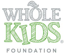
2-COLOR STACKED Used only if you CANNOT use the primary stacked version due to spot color constraints.