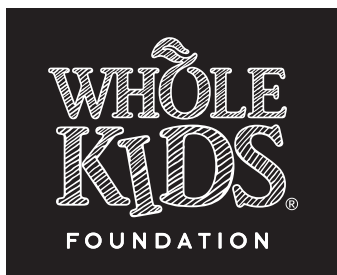
REVERSED STACKED Used only on darker backgrounds.