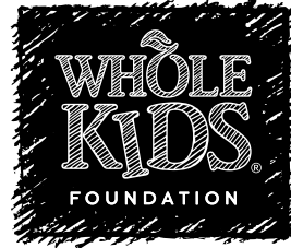
BW SKETCHBOX Used only if you have to place the logo on a busy background. We do have a reversed logo that can be used instead of the sketchbox.