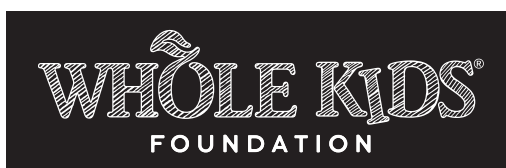
STACKED HORIZONTAL Used only on darker backgrounds when space constraints demand it.