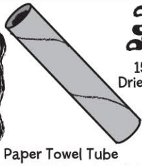
Paper Towel Tube