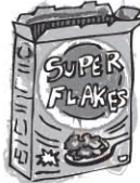
Cereal Box or piece of thin cardboard