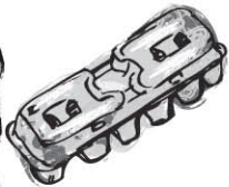
Cardboard Egg Carton