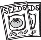
1-2 Seed Packets