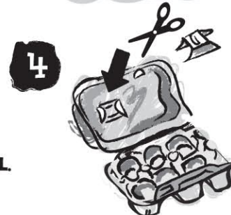
Open carton. Push the cardboard piece through the top of lid and trim it off with scissors.