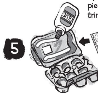
Glue label to the inside lid of carton.

Follow the instructions to start your seeds!