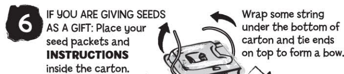
IF YOU ARE GIVING SEEDS AS A GIFT: Place your seed packets and INSTRUCTIONS inside the carton.

Follow the instructions to start your seeds!