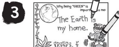
Fill out and decorate your LABEL . Think about what message you would tell the EARTH .