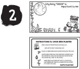
Cut out LABEL and INSTRUCTIONS .